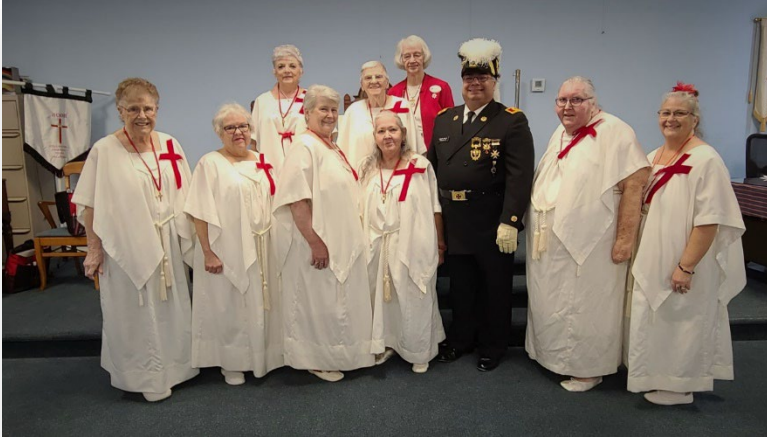
Officers of Stillwater Assembly No. 124

My beloved knights, this is a necessary and worthwhile endeavor for all of us.